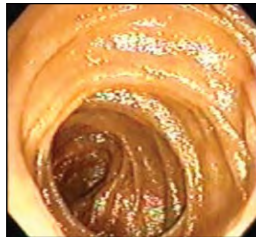
1. Direct visualization of the duodenum