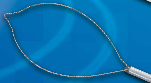
iSnare® system - oval snare