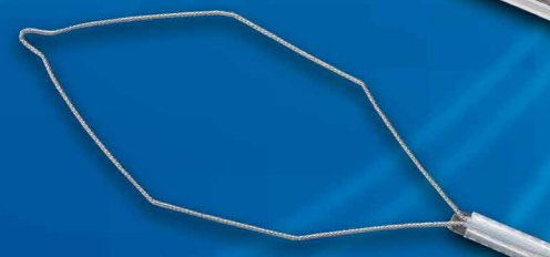
iSnare® system - hexagonal snare

For more information on the iSnare® system — contact US Endoscopy today.